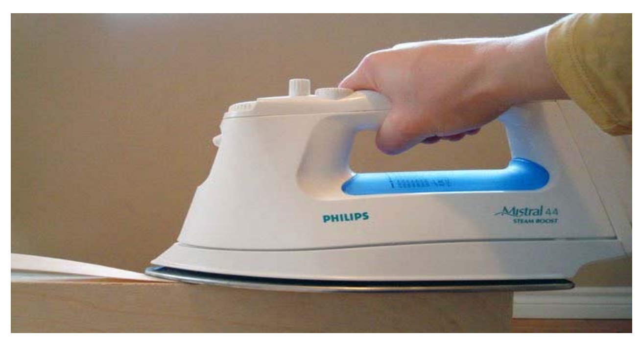
"Pressing" firmly is preferred rather than an "ironing" technique. Just hold your iron in one spot for about 20 seconds. It will take time for the hot iron to soften the glue line enough

5. With your edgebanding in position, apply the iron to melt the glue.